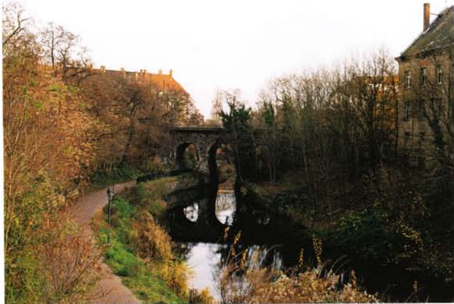
01 (previous page)